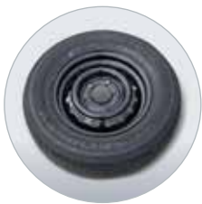
Accessory: spare wheel