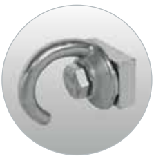
Accessory: net hooks