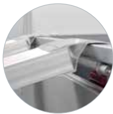
Accessory: universal aluminium ramps

A standard equipped KLT-Pro will do just fine, but sometimes you want a little extra loading space or comfort. Anssems has several accessories in its range. Depending on what you wish to transport, you can optimise your Anssems KLT-Pro with original accessories.