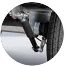
Accessory: axle shock absorbers for extra comfort