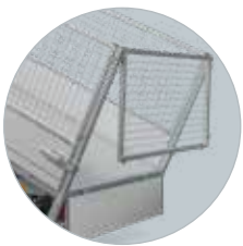
Accessory: mesh sides